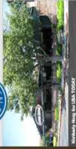
Kennedy Hong for USA TODAY