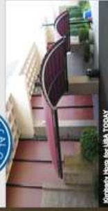
Kennedy Hong for USA TODAY